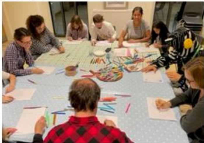
We are grateful to building contractor Myco , who sponsored our September Supper Club