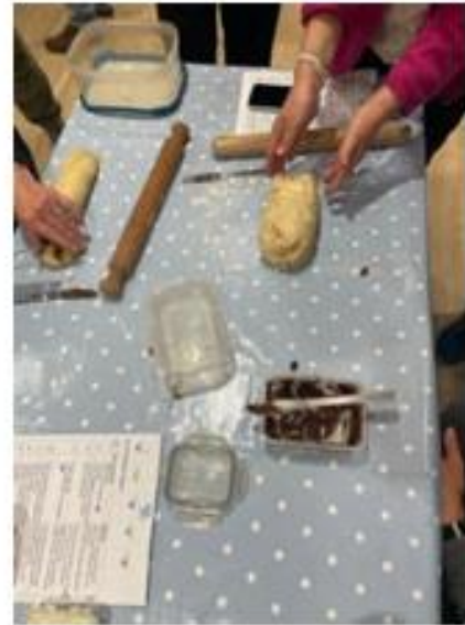
Cakes and art workshops are part of the café every week