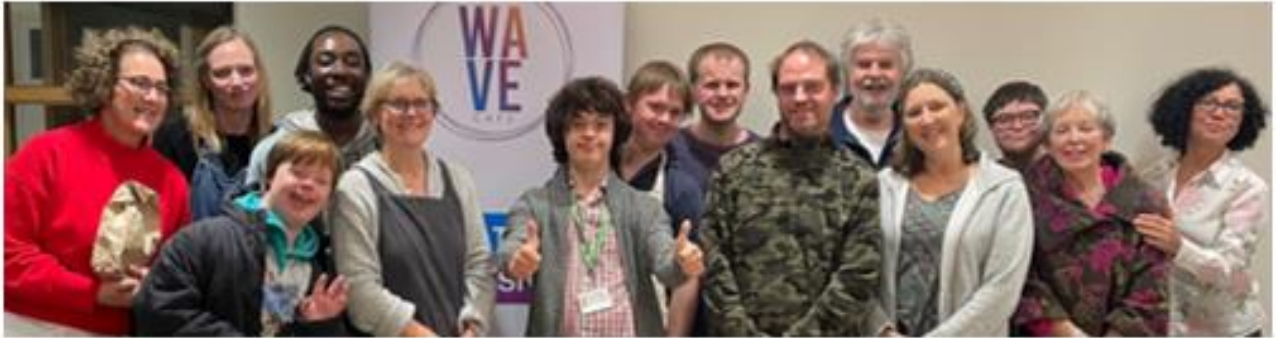
We rely on partnerships, such as with CJ's Bakery (above) and Harington Scheme (below)

Trustees' Annual Report and Financial Statements for the Period Ended 31 December 2022