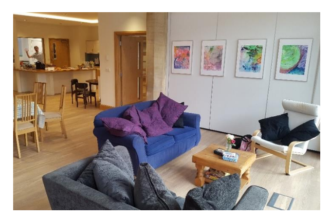
Café seating space at the United Reformed Church

The start of 2020 saw Wave Café launch its much anticipated weekly inclusive community café. Running in the United Reformed Church, Muswell Hill, where we had previously run successful trial events, Wave Café opened its doors in January.