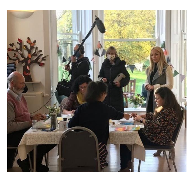
Presenter Katie Piper meets attendees at the pop-up event.

In October, Wave Café was filmed for national television: BBC Songs of Praise. The feature was about Wave For Change, Wave Café's original inspiration, and how their inclusive ethos has spread out to wider community projects, including the setting up of Wave Café in 2017.