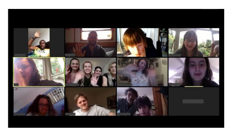
Friendly faces on a weekday social zoom call

While meeting in person was impossible, providing inclusive activities and social space wasn't – it just needed to be moved online. So, along with everyone else in the country, we moved over to Zoom! Thanks to the inspired ideas of Jessie Webster, a long time Wave For Change and Wave Café community member, we launched a daily social Zoom chat.