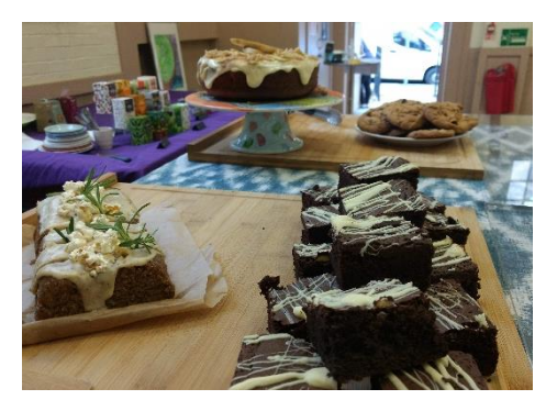
Yoga, cakes and lots of smiles at The Birchwood Centre for our re-opening in the autumn during 'tier-2' restrictions.

We were fortunate to be able to run this Friday event through much of the autumn, until a return to higher alert levels under the national tier system, and a second lockdown in December, meant we had to close our doors once again in the interests of public safety.