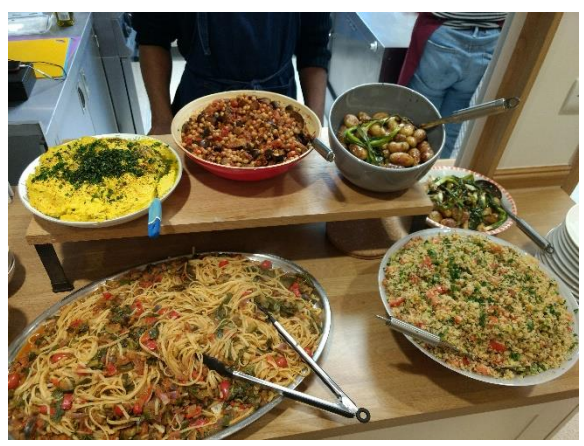
Members of our inclusive kitchen team... and some of their handiwork!

In conjunction with the daytime café offering, Wave Café maintained the offer of evening inclusive events, running monthly art and creative workshops such as Japanese Shibori Tie Dye, Meditation and Empowerment Circles.