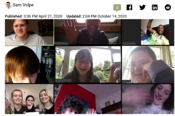
A Wave Zoom chat.

Muswell Hill charity's support is 'lifeline' for families with learning disabilities during coronavirus lockdown