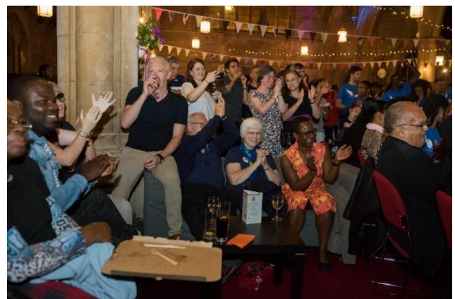
Images from the 'Wave For Change Day' party at St James' Church