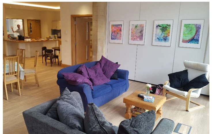
Kitchen and café spaces at The United Reformed Church, October 2019