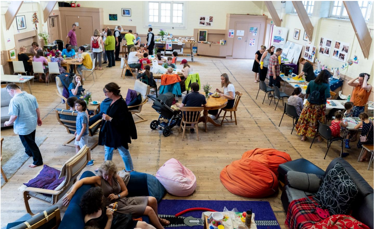
Daytime café at the Birchwood Centre, July 2019

Trustees' Annual Report and Financial Statements for the Period Ended 31 December 2019